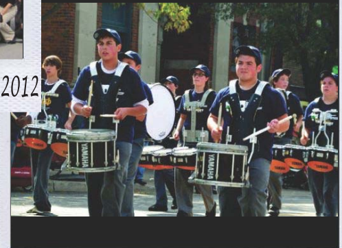
Niagara Wine Festival Grande Parade 2012