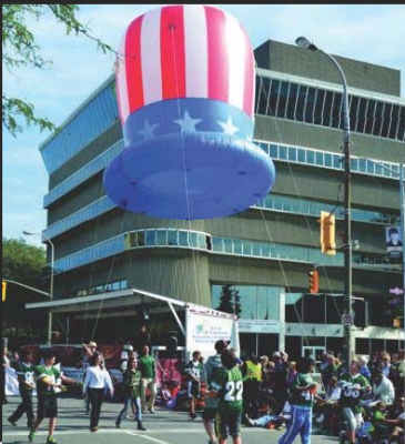
What a Grape Day for Niagara Catholic!